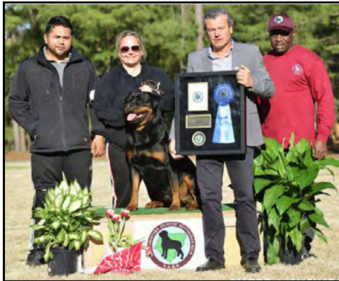
Yumbo vd Alten Festung